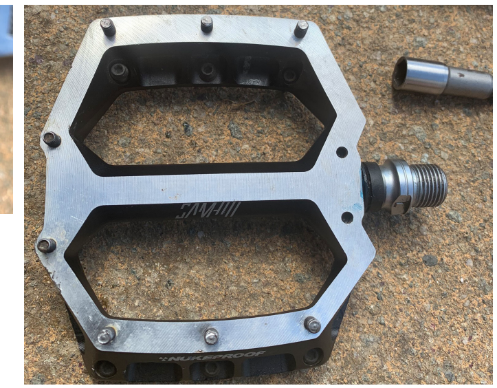
15. Your pedal is now rebuilt and ready to re-fit to your bike.

13. Push bearings into place using the pedal nut socket and then retighten nut.