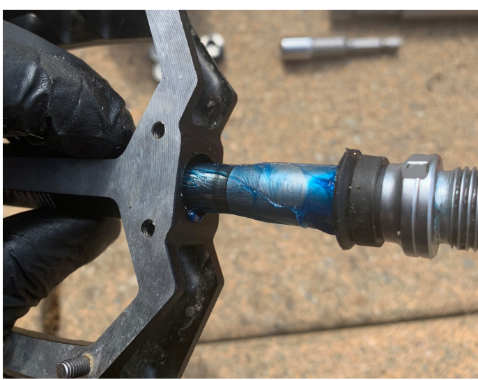
11. Take your axle, install the new seal, apply grease and insert into pedal body.