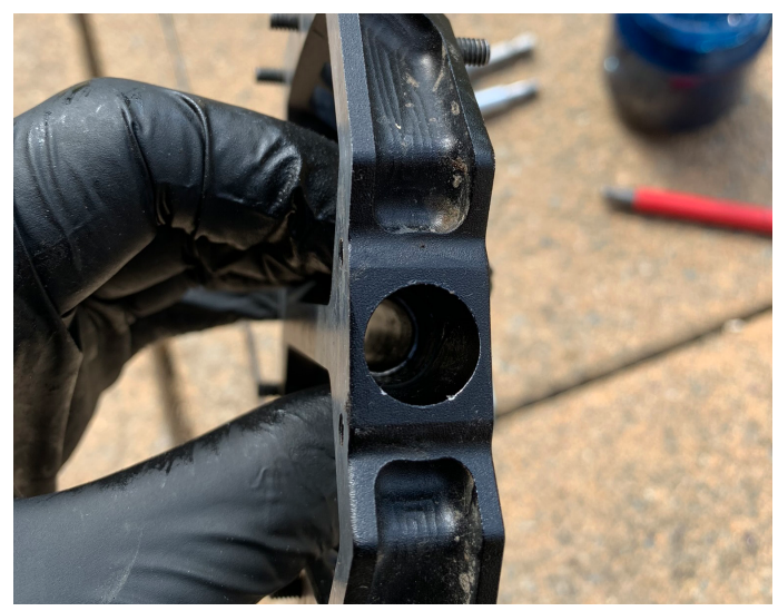
5. Visually locate the bushing in the pedal body, it will be visible from the inner side of the pedal body.