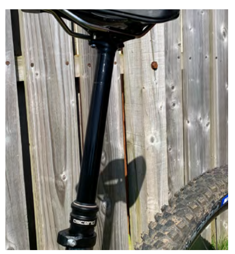
33. Your seatpost is now fully fitted and ready to ride.