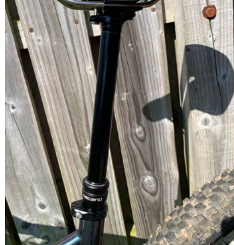
27. You can now push the lever and push down on the post to see it compress and then push the lever again to extend. Repeat 5 times If the post is not functioning or the lever feels sloppy, check your cable tension.