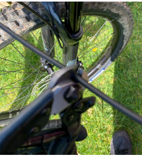
13. Double check cable routing is all correct then cut the outer cable to length and fit ferrule.