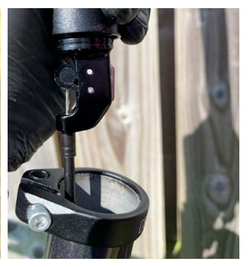
18. Secure the outer cable into the bottom of the post and ensure all excess inner cable is at the front of the bike.