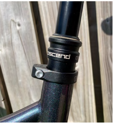
20. Insert seatpost to required depth using the measurement from step 6.