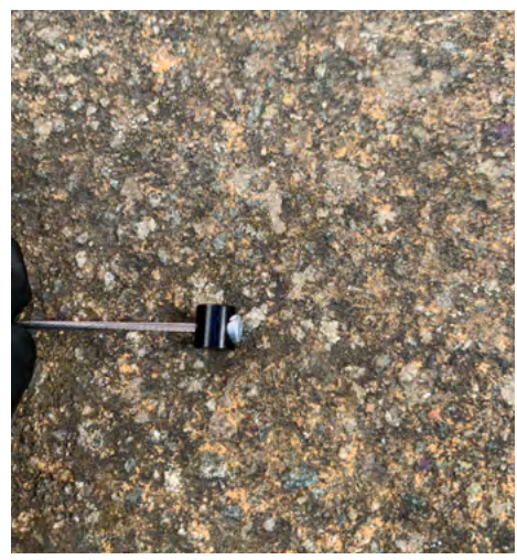
15. Take the cable head cover and install it on the inner cable.