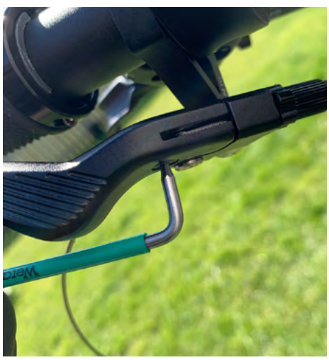
26. Pull the inner cable tight and tighten the grub screw.