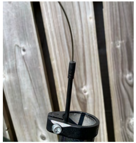
16. Install the inner cable into the outer from the seat tube end. You will end up with a lot of excess inner cable at the front of the bike.