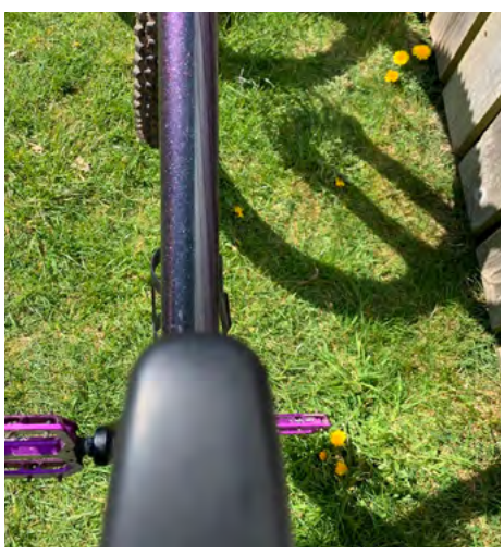
30. Gently loosen the seat clamp bolt and ensure saddle is straight then retighten.