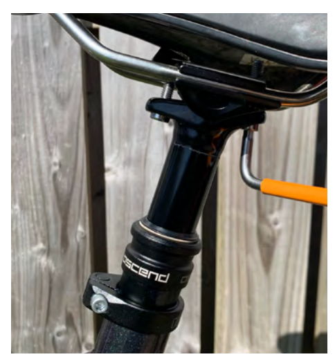
31. Adjust saddle angle using the clamp bolts and when happy fully tighten bolts.