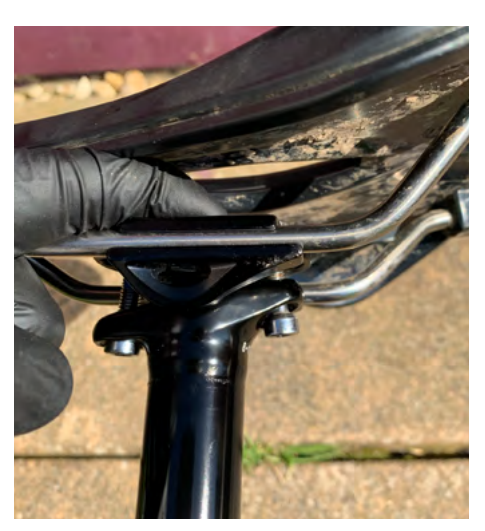
3. Fit your saddle on the seatpost saddle clamp ensuring correct orientation. Note: The back of the seatpost has the laser etched height markings.