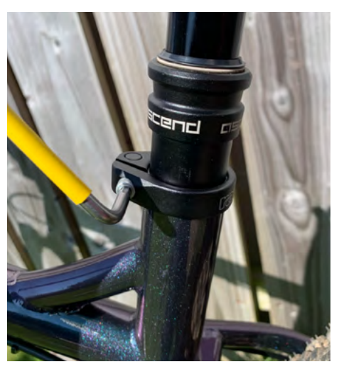
8. Remove the seatpost from your frame.