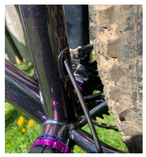
9. Install the outer cable into your frame following your frames cable routing. Leave some outer cable sticking out of the seat tube with most of the excess cable at the lever end. Cable should be left free to move in the cable guides at this stage.