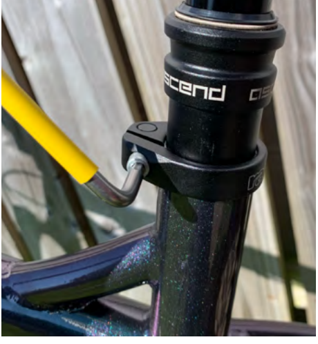
5. Insert your seatpost to the frame and tighten the seat clamp.

At this stage you will need to have a short ride and manually adjust the height of the seatpost until it is in a comfortable riding position in the fully extended position.