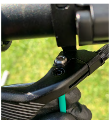
23. Move the lever to the closed position and then place the barrel into the lever. Note: You cannot let go of the barrel until the cable is installed so its handy to use a hex key to hold it in place.