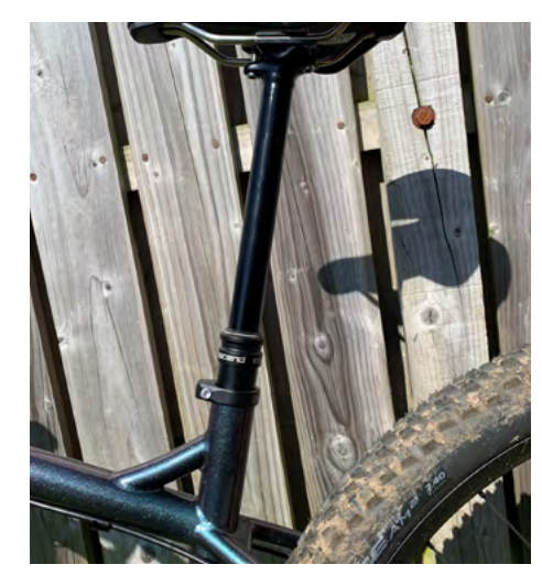
6. With the seatpost now in the frame and adjusted, note down the distance from the top of the seat clamp to the bottom of the seatpost collar. You will need this later for final setup.