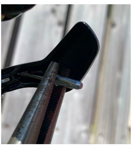
29. Push the cable crimp on over the end of the cable then squeeze with pliers.