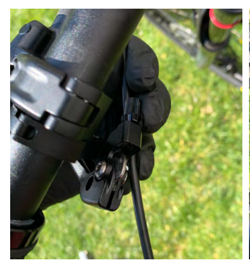
12. Line the outer cable up to the lever and determine the correct length required.