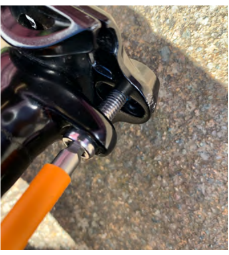
2. Loosen the seatpost clamp bolts using a 5mm hex key.