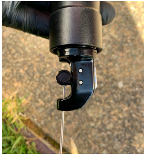
17. Insert the cable head into the dropper actuator.