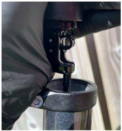
10. Ensure the ferrule is on the cable and then push it into the bottom of the seatpost.