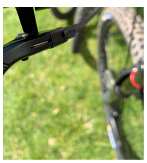
24. Route the inner cable though the lever and then through the barrel.