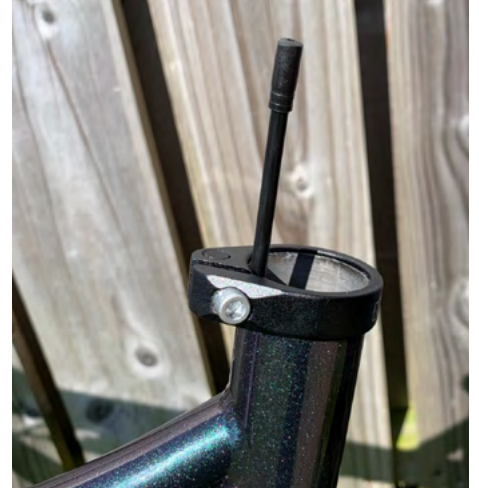
14. Remove the seatpost from the frame and push the outer cable back through the frame until the end is sticking out of the seat tube You will likely end up with the outer cable down towards the downtube, this is completely normal at this stage.