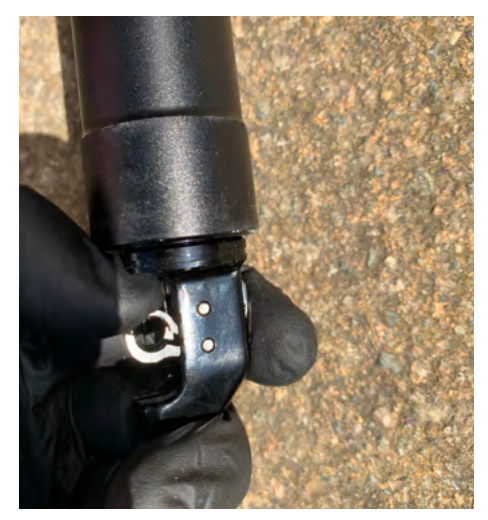
1. Fully extend the dropper post by pushing down on the actuator.