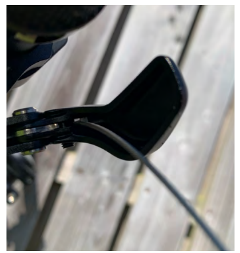
25. All the excess inner cable should now be sticking out of the lever and the outer cable should be in position. At this stage it is worth double checking your outer cable routing is good.