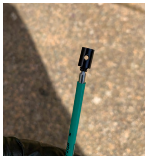
22. Take the small cable barrel and undo the grub screw a few turns until it is no longer blocking the hole.