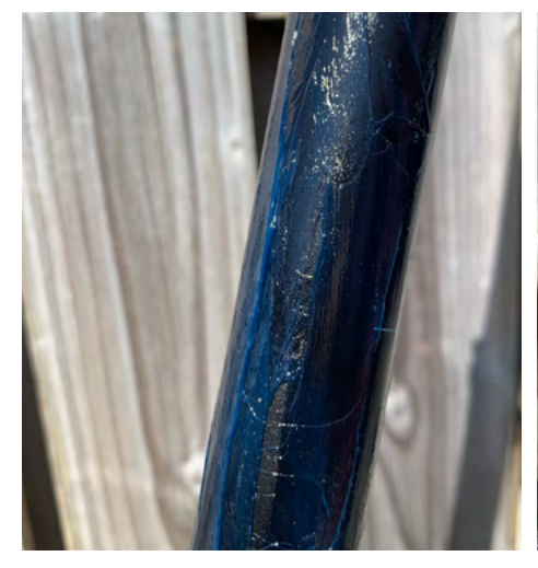
19. Apply grease to the outside of the seatpost.