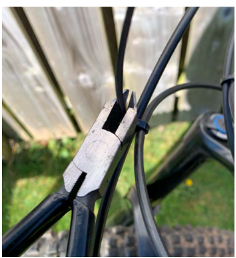
32. Tidy up any cables using cable ties and snip off ends.