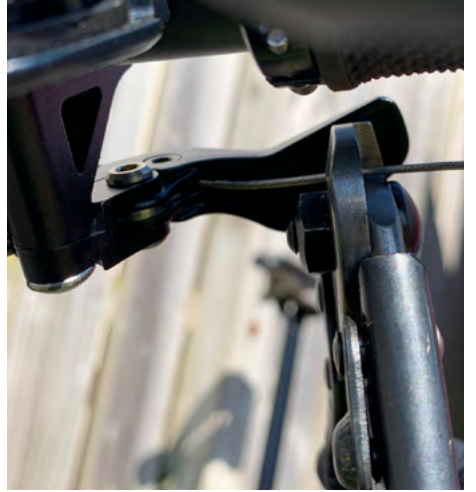
28. When you are happy the seatpost is functioning correctly, trim the excess inner cable using cable cutters.