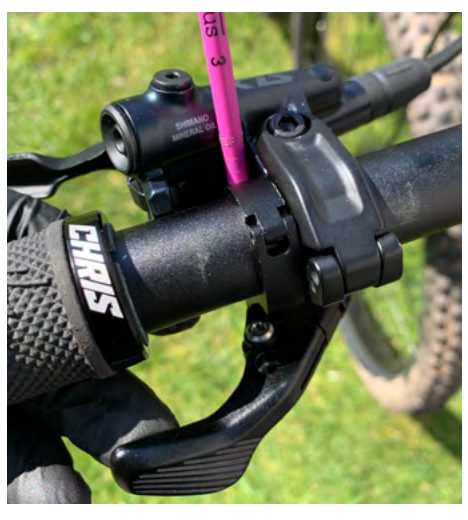
7. Fit your dropper lever to the handlebar using a 3mm hex key.