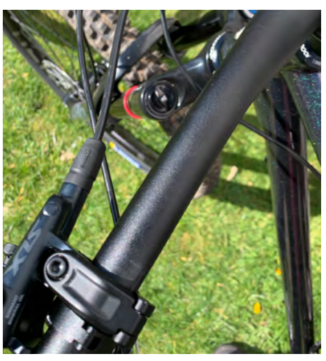
21. Carefully pull the outer cable and get it up close to the lever.