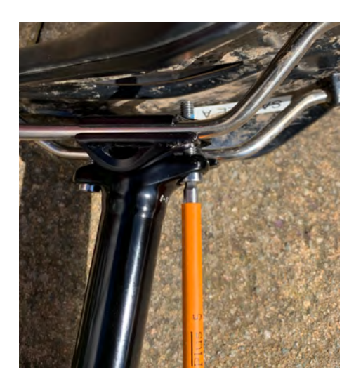
4. Tighten bolts (don't worry too much about saddle angle at this stage).