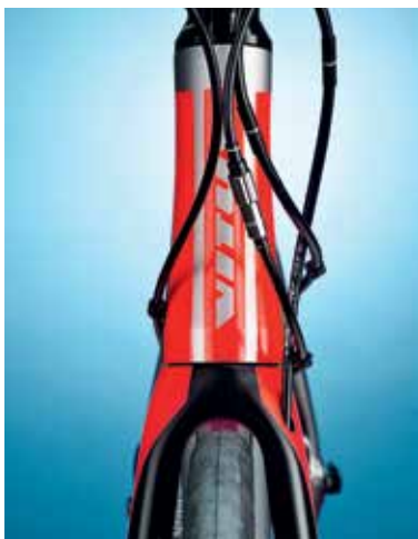
The Zenium SL Pro Disc comes specced with 25mm tyres but has clearance to fit 28s

With some CX tyres on its alloy clinchers, it would make a relaxed gravel ride