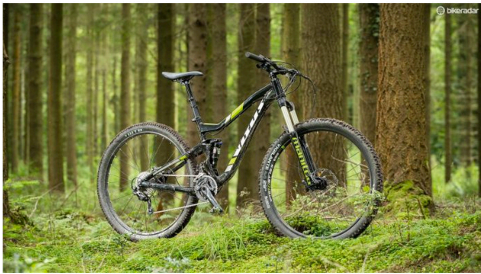
The Vitus Escarpe 290 VR is an awful lot of trail bike for the money (Russell Burton)