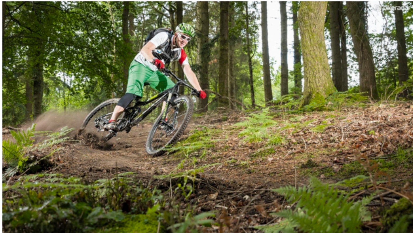
The Escarpe needs little invitation to cane its way downhill

The naturally smooth-rolling, speed-sustaining effect of the large volume 29ertyes , on reasonably wide tubeless-ready rims, maximises 29er control and momentum. All in all you've got a proper trail tank that mows through long stretches of serious sized debris without flinching.