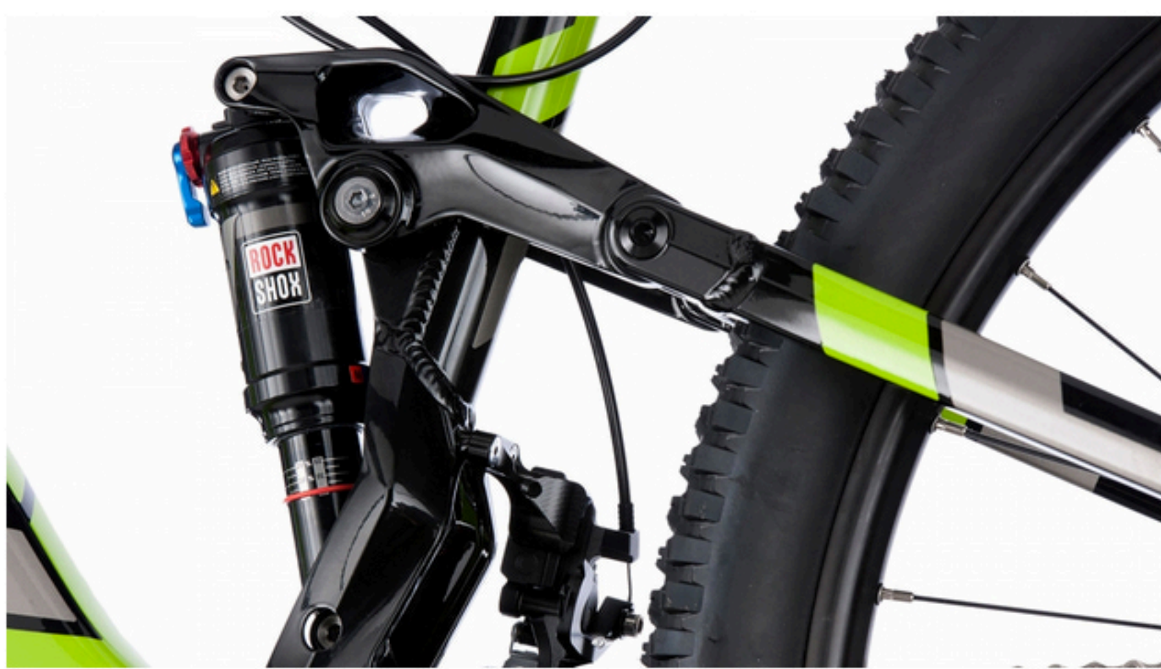
The Monarch RL-augmented suspension starts plush but retains its poise when cornering

What's undeniable is that you're getting an incredible amount for your money. The most impressive part is the inclusion of a KS E-Ten external cable dropper post as standard. That means there are no immediate upgrades to be made to create a totally trail ready bike and also makes it clear that this is primarily a big hitting fun bike.