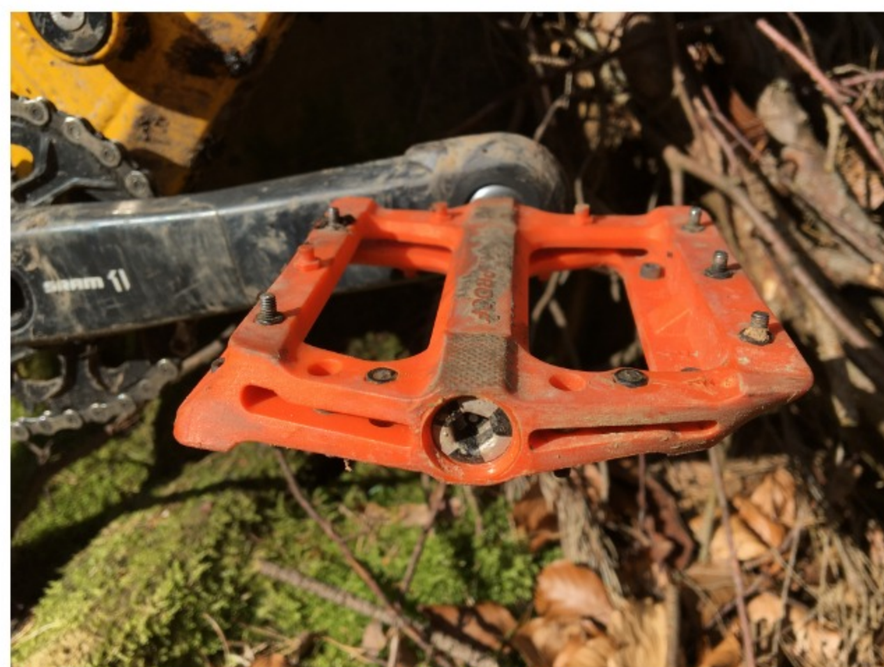
The alloy pins can be bit fragile when up against multiple rock strikes

The pedal suffered a lot of rock strikes whilst riding regularly on Welsh trails but the nylon body has survived relatively unscathed. Going back to the pins however, they haven't fared well against the rocks. One particularly jarring hit sheared off two of the outside pins completely; it seems the alloy construction is more brittle than a steel pin. The good news is the reverse nature of the pin fitting makes replacing a doddle.