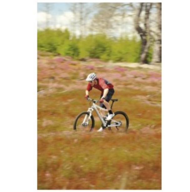
Tested: Orange ST4