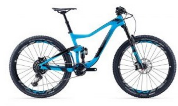
Giant Trance Advanced 0 (2017) first ride