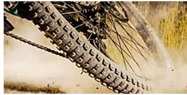
Grim's Ditch, Chilterns route