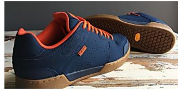
Arrivals: this week's new stuff in for review