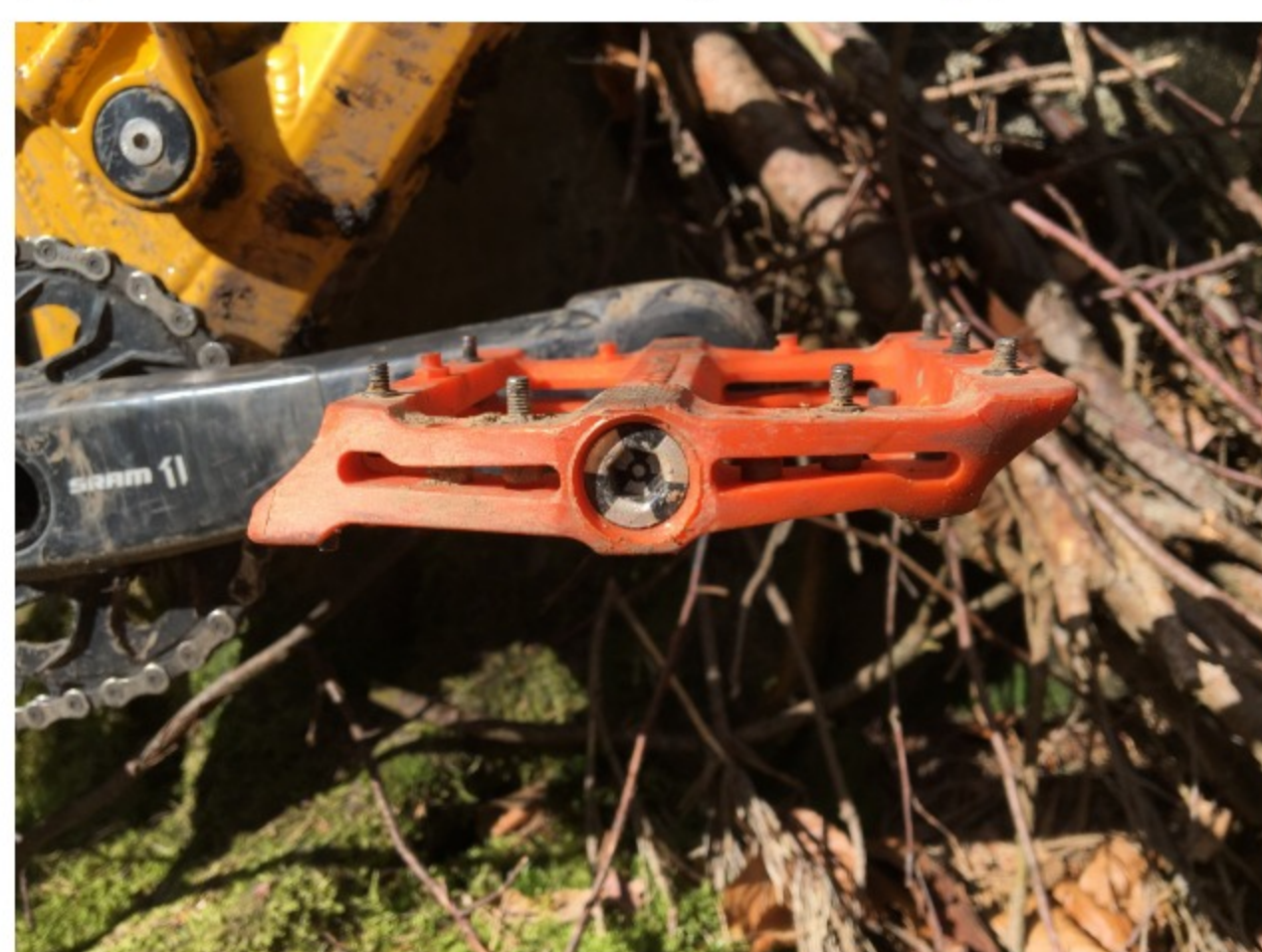
The Neutron is impressively thin for a plastic pedal

The platform isn't as large as some, but at 98mm x 95mm it is in the ballpark. As well as the standard (read useless) moulded pins, Nukeproof fits the Neutron with seven replaceable alloy pins per side. These are reverse fitted and can be adjusted to fine-tune grip.