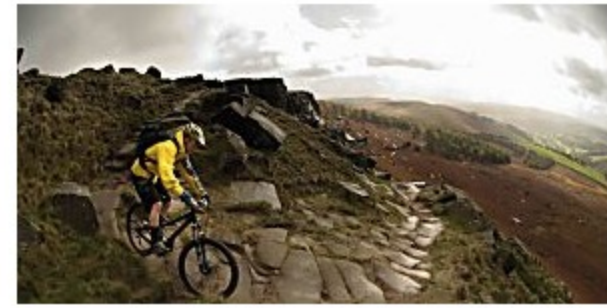
Houndkirk and Stange, Peak District route