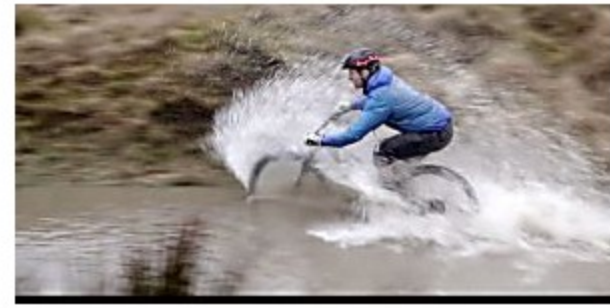
Round 1 of the PMBA Enduro Series was just a little bit wet