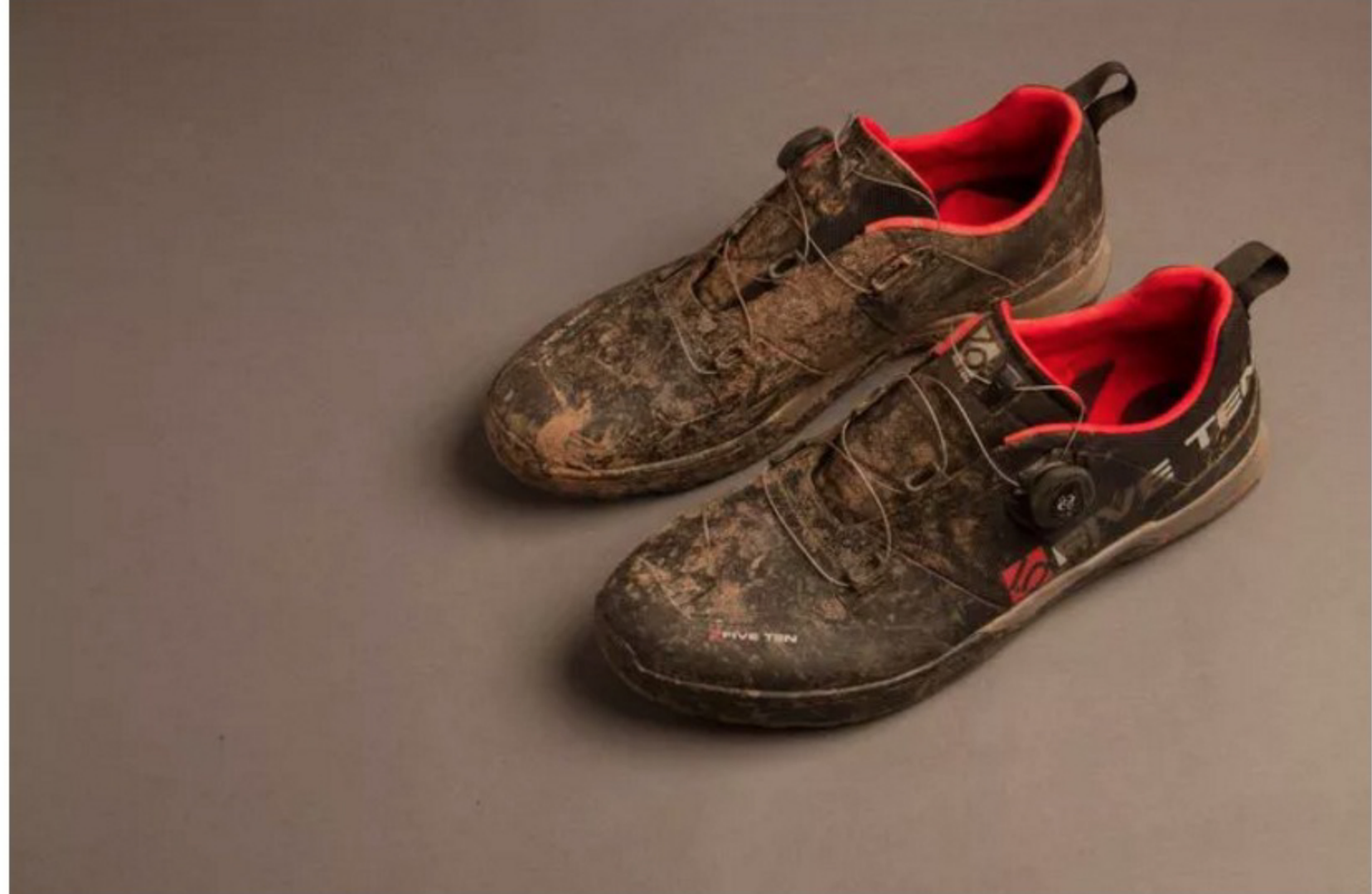
Beaten with Welsh mud and rain over the last few months and ready for more.