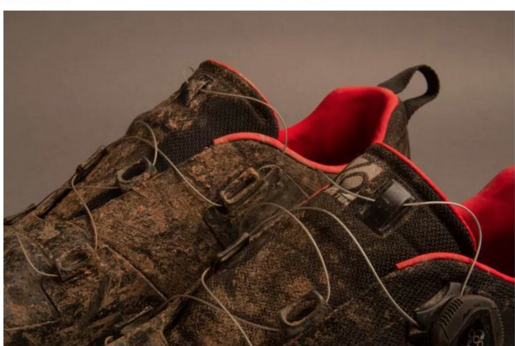
Getting the fit right is key on any shoe and the Kestrels were spot on for us.

Inside the Kestrel has an Ortholite insole for added comfort and a 'bellows-tongue' (the side of the tongue are attached next to the insole) which helps keep out trail rubble. The weight is competitive. Listed at 403g each shoe (we weighed a test shoe at 540g, with cleat and mud) similar to shoes offering this blend of performance and protection.